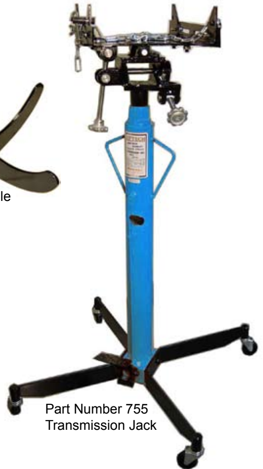
Part Number 755 Transmission Jack