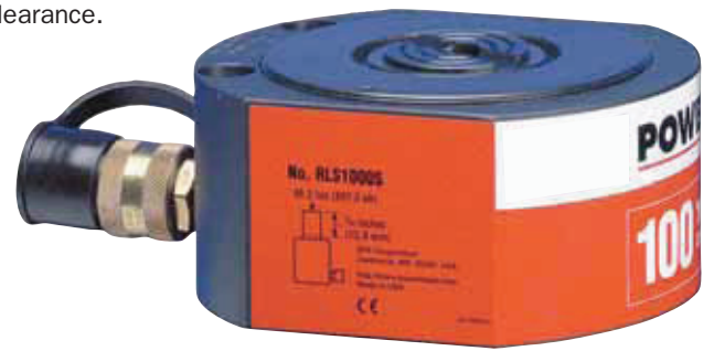
ASME B30.1 700 bar