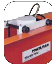
Cylinder is easily moved across width of upper bolster.