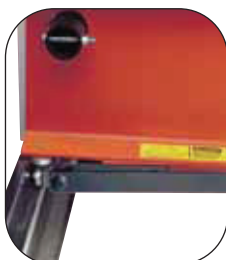
Bearings make bed positioning smooth and easy.