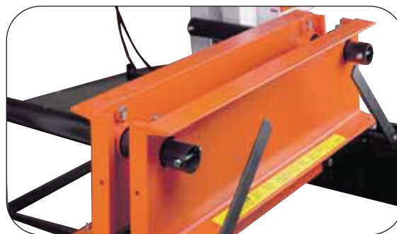
Width adjusts from 102 mm to over 686 mm; is secured with locking bolts.