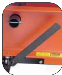
Lever lowers bed for pressing, raises it for rolling.