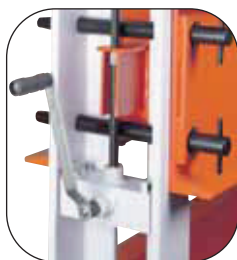
Lifting screw and locking pins make bolster raising a one-man job.